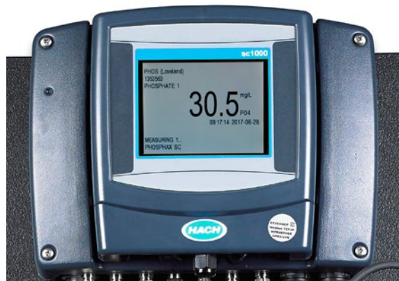
Figure 4: Example Phosphax real-time data