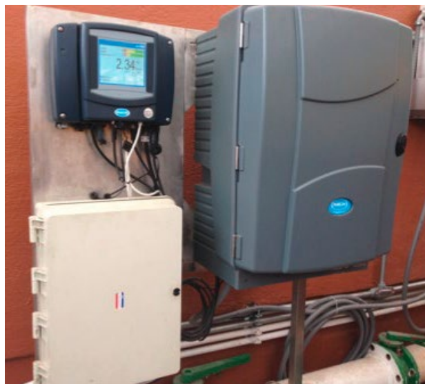
Figure 3: Example RTC-P system

The customer receives onsite and remote support from Hach specialists assisting with installation and ongoing monitoring through the RTC Helpdesk, keeping operations running smoothly. The Phosphax™ tests the water every 5 - 7 minutes and provides the RTC-P controller with up to 288 data points per day, which then adjusts the chemical dose in real-time to handle spikes in phosphate levels or reduce dosage during overfeed situations. Hach also paired the RTC-P with its Prognosys™ predictive diagnostic system to ensure compliance by preventing unexpected instrumentation emergencies. If phosphate levels exceed set limits, the helpdesk and plant operators are notified via text message immediately so they can address any issues with chemistry or equipment. The RTC-P system allows the WWTP to manage phosphorus removal with confidence.